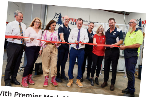
With Premier Mark McGowan at Steel Blue in Malaga! I'm proud to support such a great local manufacturer, and have advocated for them at the federal level.