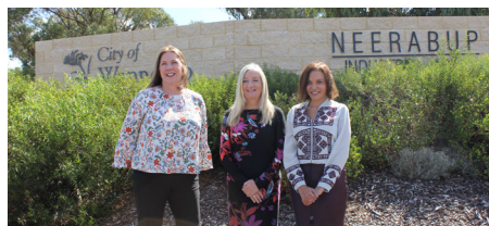
I took local business leaders & Shadow Minister for Infrastructure, Catherine King, on a tour of Neerabup. I have a plan for local jobs in the northern suburbs.